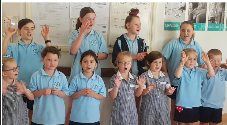
Foundation students and Grade 5/6 enjoyed singing at the hostel.