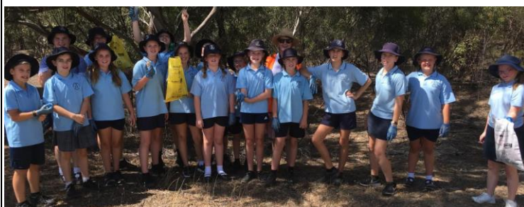
The Grade 5/6 class did a great job cleaning up the tennis court and hall area.