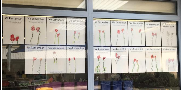
F/1/2 classroom poppies.