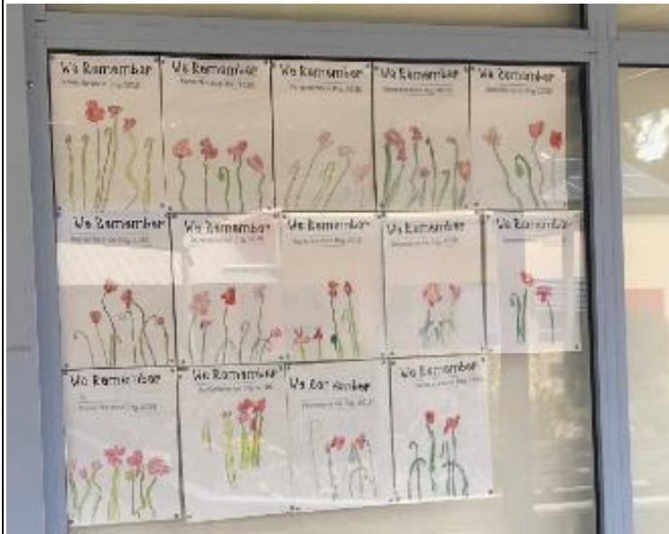
Some more F/1/2 classroom poppies.