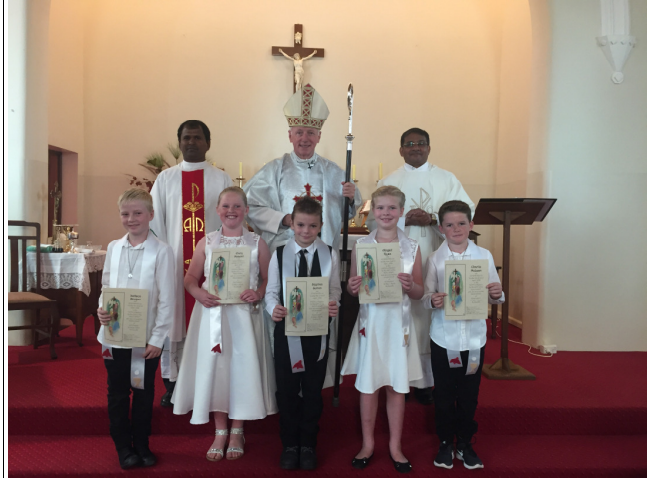
Sacramental candidates 2018.

they completed the Steps in Faith program over six weeks in term one.