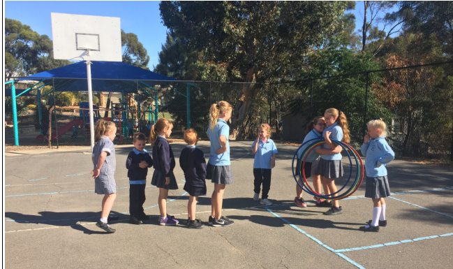
Some of our students at play.

The sports & OHS leadership team have begun the netball sessions at break times for junior - Monday and senior - Wednesday students. They have considered also doing football sessions and will seek an alternative time to trial the sessions this week.