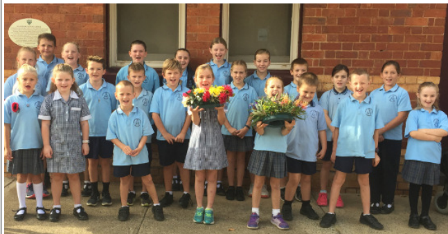
Some of our students after the Anzac day march.