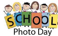
Photo envelopes will be sent home shortly. There is the option to pay online (please see flyer attached ). All photo orders/money need to be finalized before Thursday, 19 April . Kindly note that all individual student photos will be taken, however family photos must be ordered.

Photography will be at St Mary's School to take individual, class and family photos.