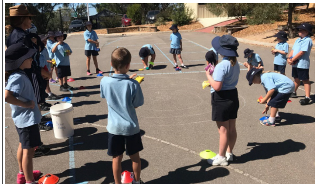
Students enjoying part of the obstacle course.