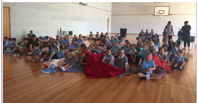
Students enjoyed the Movie Day and popcorn.

Thanks to the 3/4 and F/1/2 classes for their great fundraisers. The Movie day and Obstacle Course were great fun and helped support all of Caritas's programs in Australia and around the world.