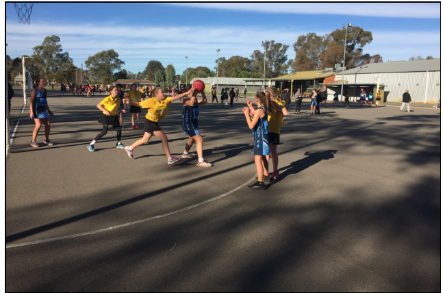
Chase, defend, arms up, run, go go go...