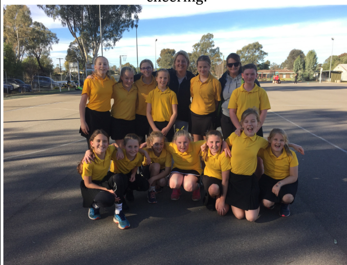
4/5/6 girls enjoying their netball at Rochester