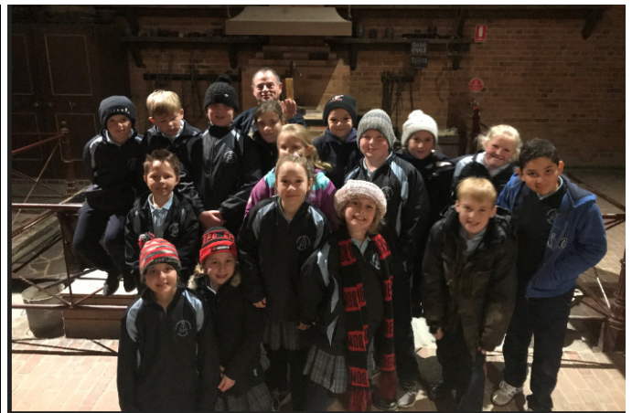
Grades 3 and 4 had a great time at Sovereign Hill.