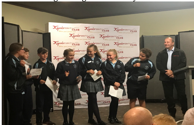
Students representing the school at the Kyabram Club.

Two weeks ago the Year 6 leaders attended a cheque presentation at the Kyabram Club. All the students got up and spoke about the money being used for our school vegetable gardens. Everyone seemed to take an interest in our Lemonade Lemons and Thorny Melons. It was wonderful to see the students speaking with such confidence out in the community. A great night was had by all.