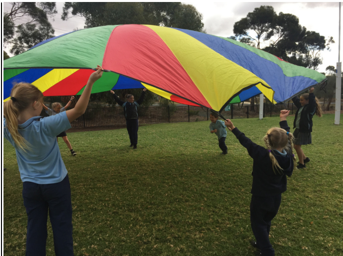
Some of the students participating in activities.