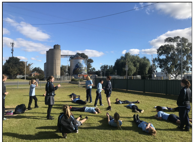
Lounging around Rochy.

Have a safe and happy term 2 holidays. See you all back in term 3.