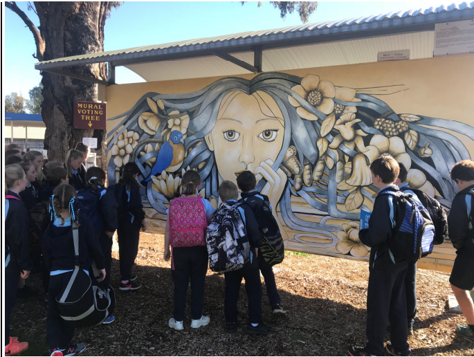
Some of the students admiring the Mural Voting Tree.