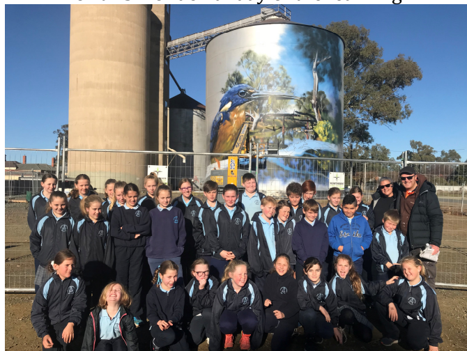
Some of the students out the front of Jimmys artwork.

Thanks to the Shire of Campaspe for funding our bus for this wonderful day of the learning.